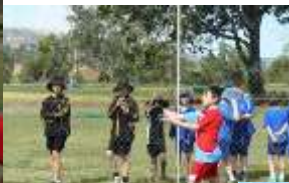
Caffey Athletics Carnival