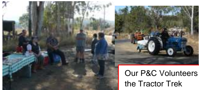
Our P&C Volunteers at the Tractor Trek